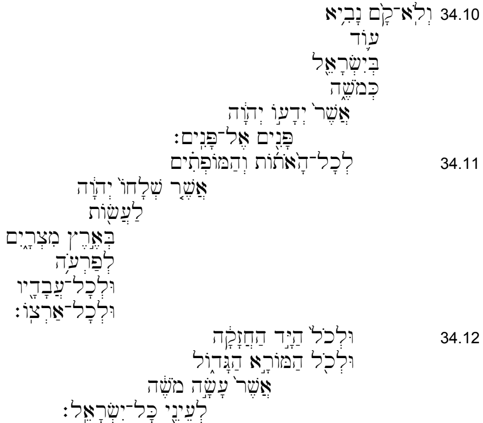
Diagram 5: Deuteronomy 34:10-12

[10] A prophet has not arisen in Israel like Moses whom Yahweh knew face to face. [11] A prophet has not arisen in Israel like Moses 63 in regard to all the signs and miracles that Yahweh sent him to perform in the land of Egypt before Pharaoh, all his servants, and all his country. [12] A prophet has not arise in Israel like Moses in regard to all the display of power and the great awe that Moses produced in the sight of all Israel.